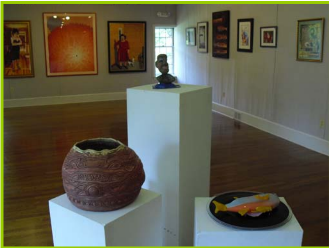
Exhibit Dates: July 9—29, 2010